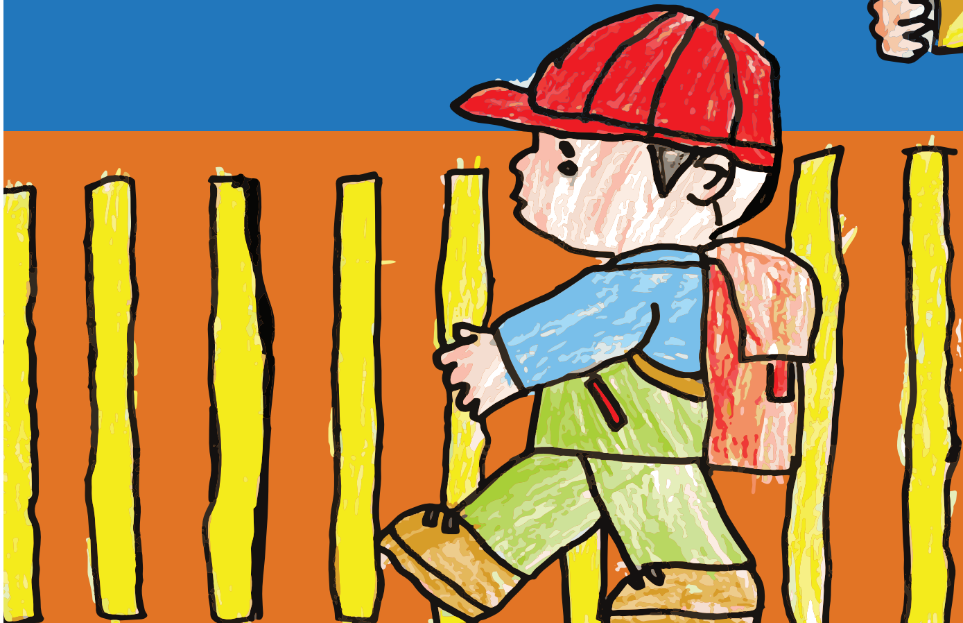
ART: CONNOR TANG, 3RD GRADE

Hey kids ... Draw or paint a colorful scene of you walking or biking. How does it make you feel? What do you see? Who do you walk or bike with?